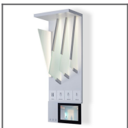
Display P230-90177M Ref: 90177M