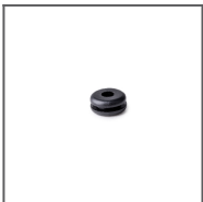
6,4x1,6 Gland Ref: 00802L