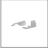
KRAV-05IN grey End cap Ref: 24308