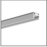
REGULOR Profile Ref: B468+43