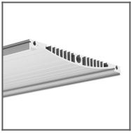
MULTI-A Profile Ref: B4570