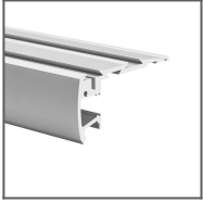
STEP Profile Ref: 18042