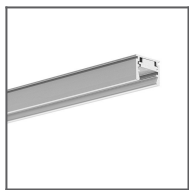
REGULOR Profile Ref: B468+43