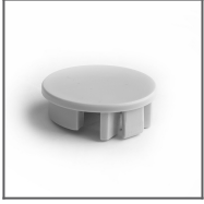
JAZ grey End cap Ref: 24224V1