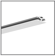
JAZ Profile Ref: B8547