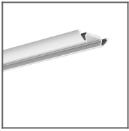
STOS-ALU Profile Ref: B4369