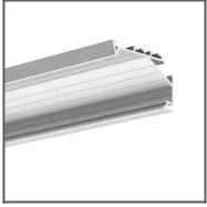
KOPRO-30 Profile Ref: B7890