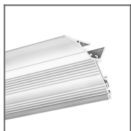
LIT-L Profile Ref: 18033