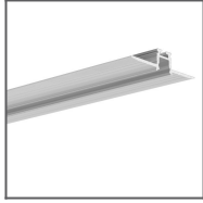
KOZEL-10 Profile Ref: C1575