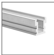
HR-LINE Profile Ref: B3579