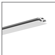
JAZ Profile Ref: B8547