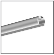
OLEK Profile Ref: B8505