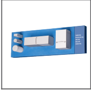
Foam 70446 Ref: 70446